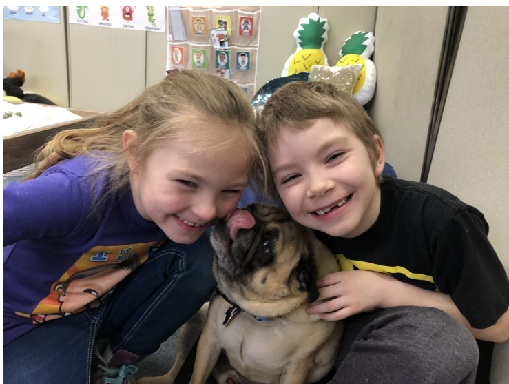
Coda and some of his friends! For more information about our pet therapy program, visit our website.